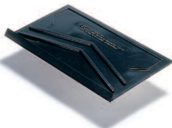
Underlay opening protector